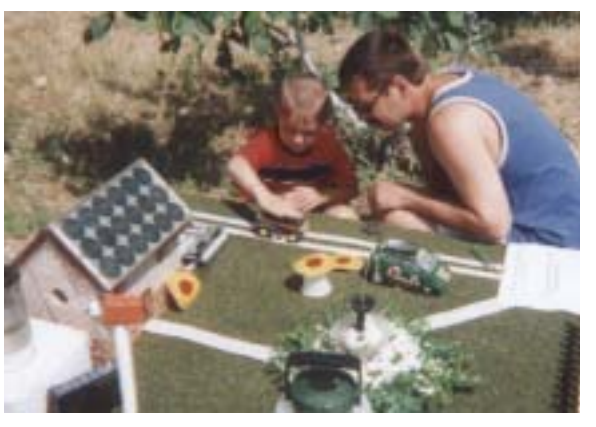
A young Romanian renewable-energy engineer learns how to use and to stop a model PVpowered car !

The project will be particularly focused on sharing practical information including the use of models, mobile exhibition units, and IT-based energy-education materials. Participants will research the most effective ways of engaging school pupils in various Western European and CEE countries, as well as share experiences of cross-cultural barriers in the use of educational resources.