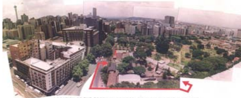
LOCATION OF THE GREENHOUSE PEOPLE'S ENVIRONMENTAL CENTRE IN THE NORTH-WEST CORNER OF JOUBERT PARK, JOHANNESBURG INNER CITY