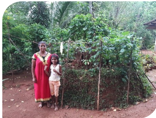
ORGANIC HOME GARDENING/FARMING