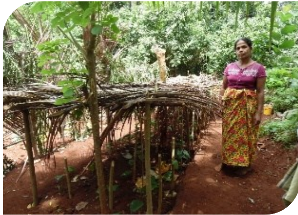
APPROPRIATE CASH CROPS