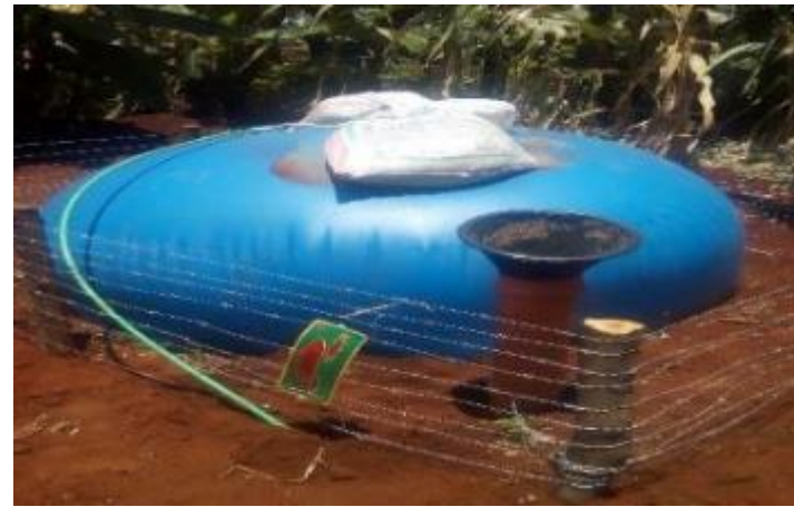
Takamoto Baloon biogas