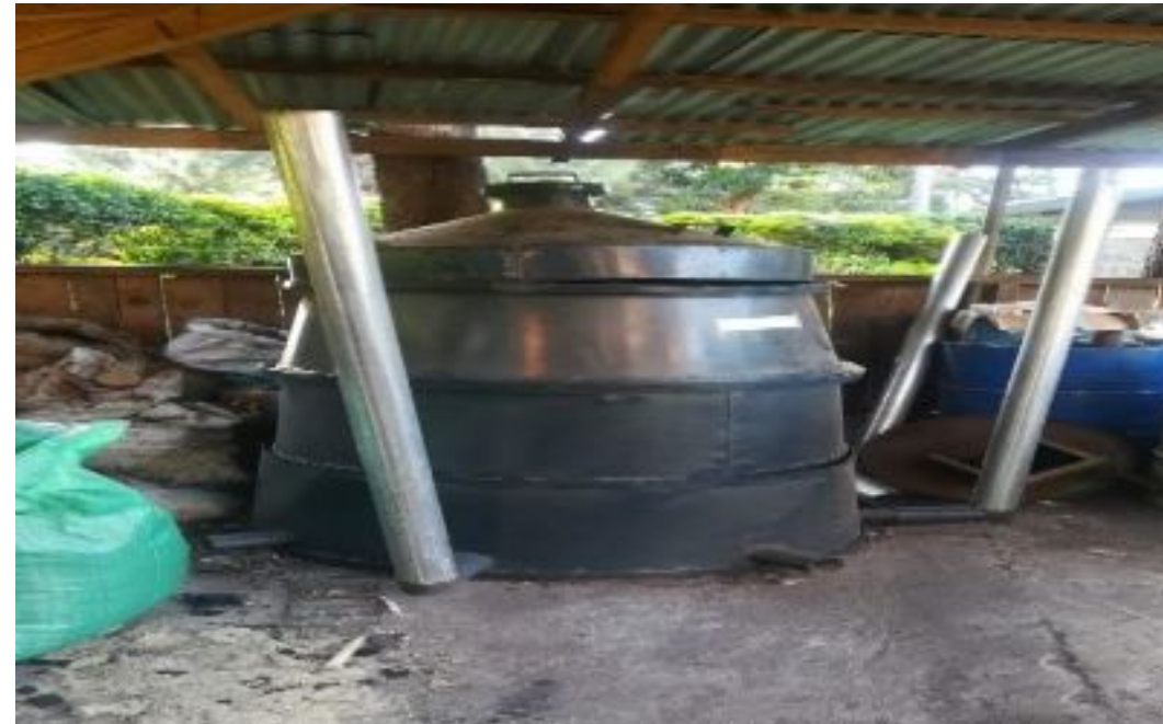
Portable metal kiln