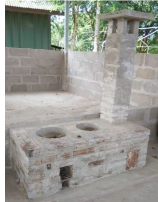
Household firewood stove