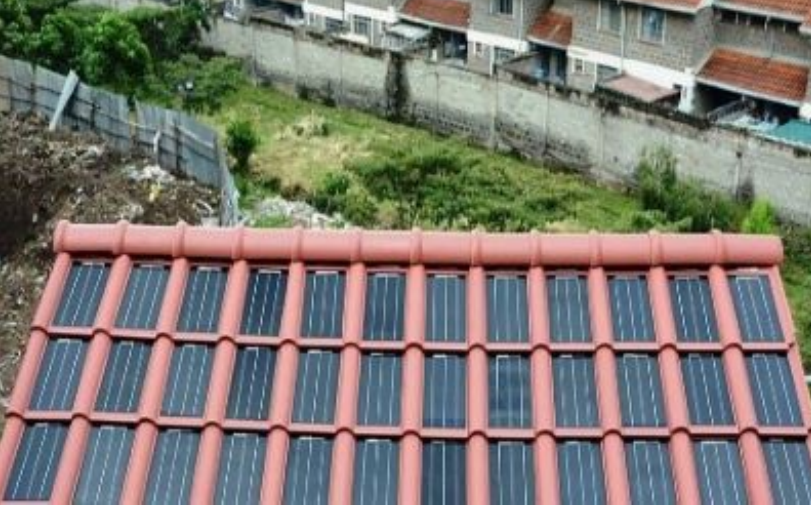
Solar PV roof