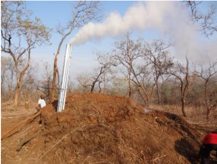
Improved Basic Earthmound Kiln