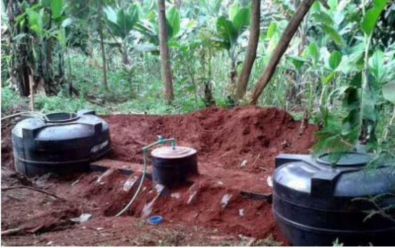
Blue flame biogas digester