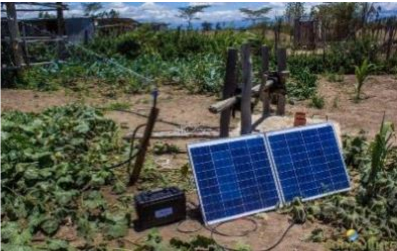
Solar powered water pump