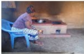
Rocket stove by Caritas department(Catholic Church in Kenya)Kitui