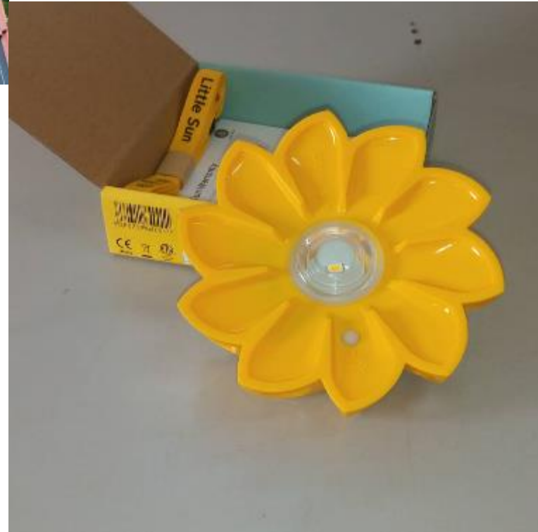
Little sun solar lamp