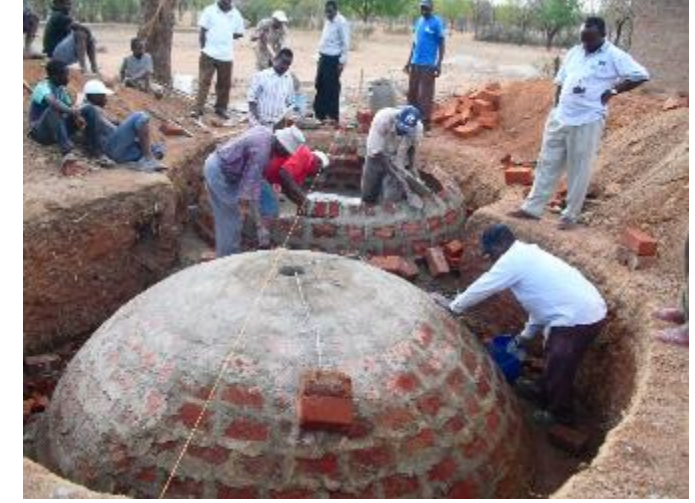
Fixed dome biogas digester