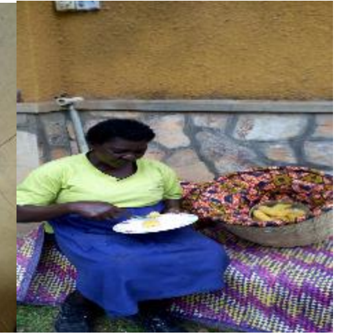
Hay Baskets – fireless cooker