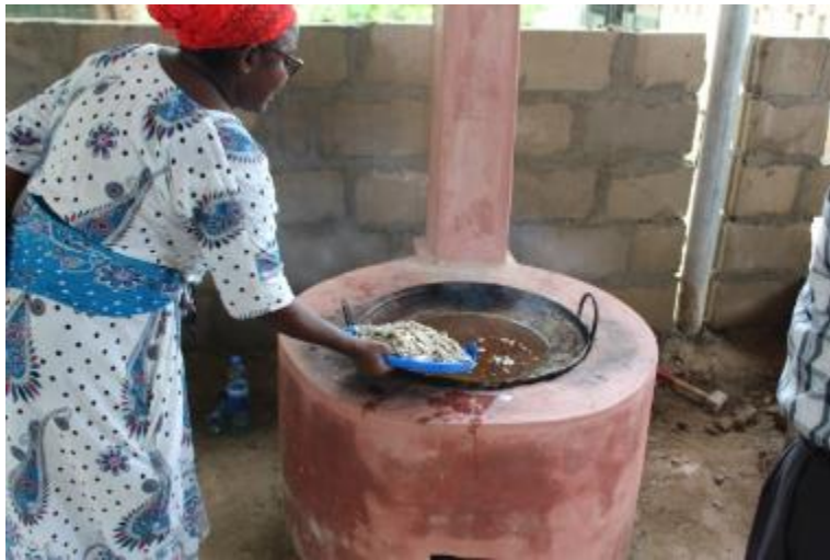
Improved fish frying firewood stove