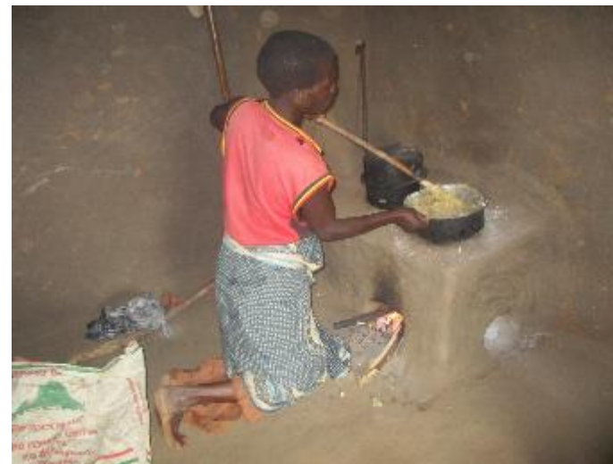
Household firewood stove