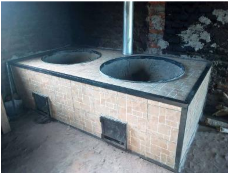
Fixed Institutional firewood stove