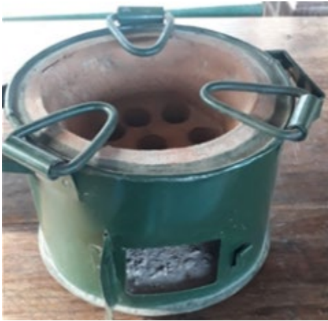
Improved Charcoal Stove