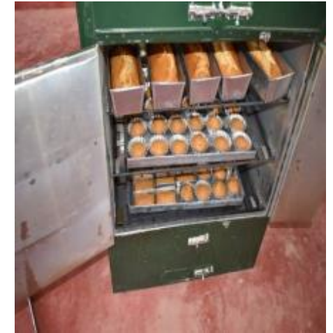
Improve charcoal baking ovens