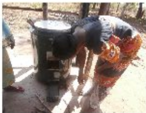
SeTa Improved Institutional Firewood Cook-stoves (SeTA-IIFC)