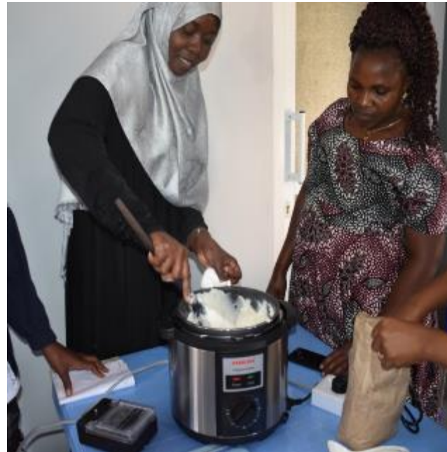
Electric Pressure cookers (EPC)