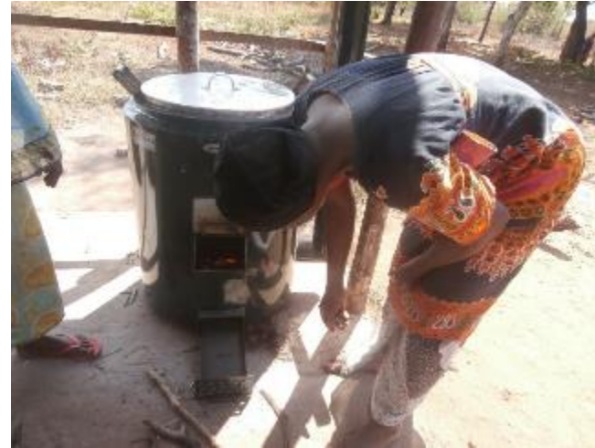
Movable institutional firewood stove