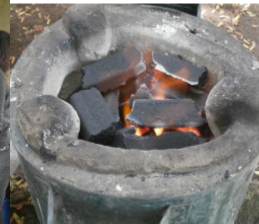
Replacement of inefficient with efficient stove reduce amount of fuelwood consumption by more than half