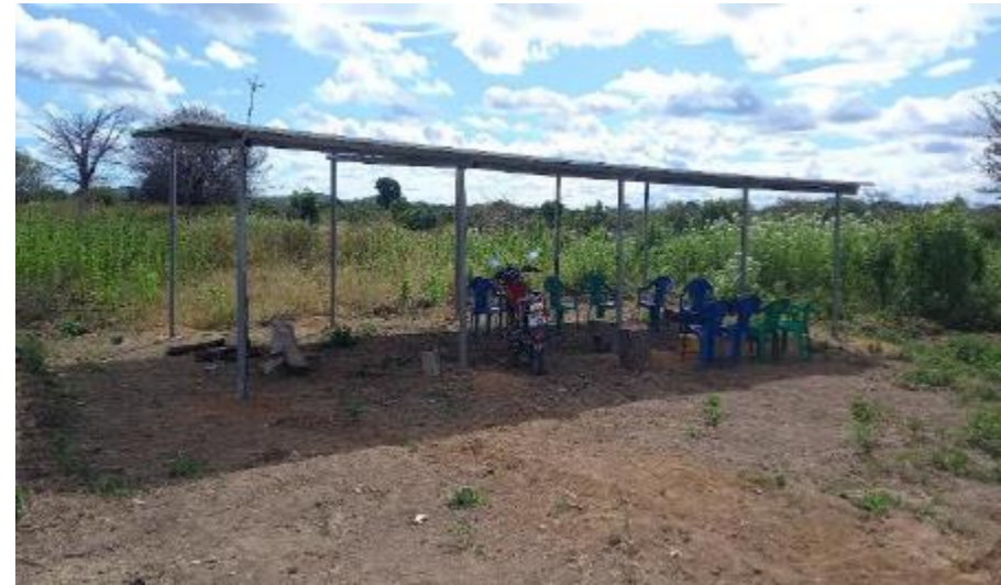
Replacement of diesel pump with solar powered pump