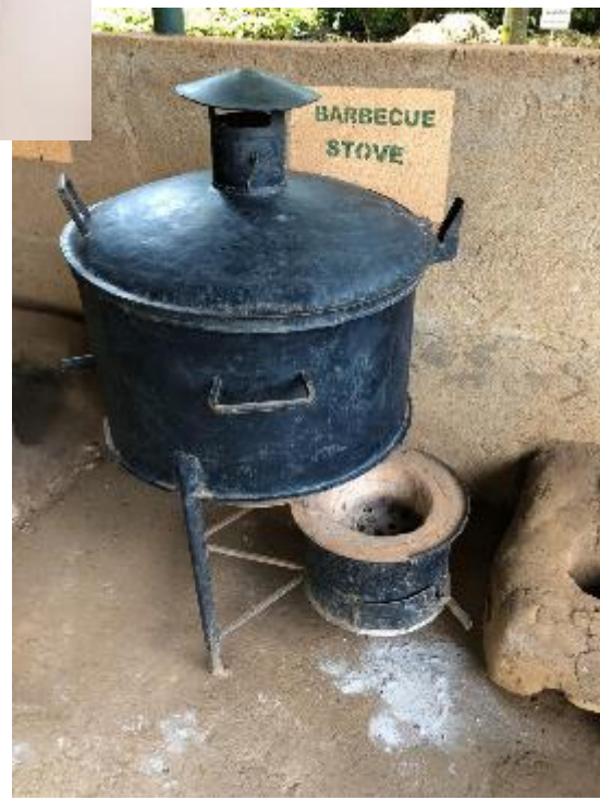
Local Climate Solutions with Poverty Reduction in NDCs. Experiences from East Africa & South Asia & Europe UNFCCC COP25, Madrid, Side Event 13/12 2019 13:15- 14:45 Organised by INFORSE - SUSWATCH - INSEDA - CCDB – SE