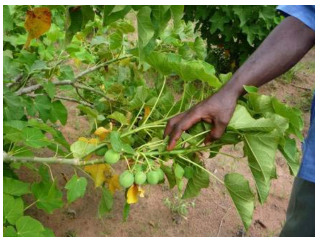
Photos: Jatropha tree and seed, a generator set