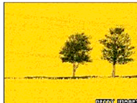
Rapeseed oil can be used to produce bio-diesel

The Co-op report claims there is a future for biofuels, but current targets for growing so much fuel could have