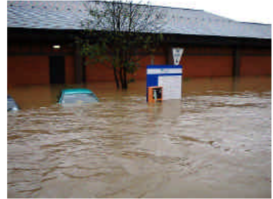
Mold floods - winter 2000/01

Further measures can reduce emissions by up to 50%!!