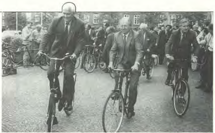
EU Environmental Ministers on bicycle in Århus, 1993

Environmental demonstration in front of the Pan European Environmental Ministers' Conference, Sofia '95.