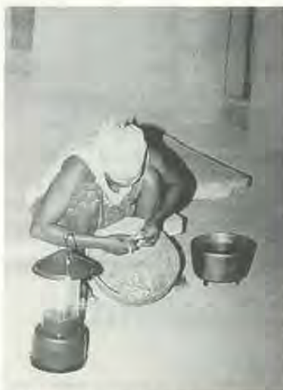
PV Lantern.

nologies Regional Training Workshop in Nairobi, Kenya as part of the regional study. The workshop brought together a wide range of participants that included representatives of NGOs, governments, RETs/solar equipment distributors, field technicians, manufacturers, utilities, and, to a lesser extent, researchers and field extension workers.