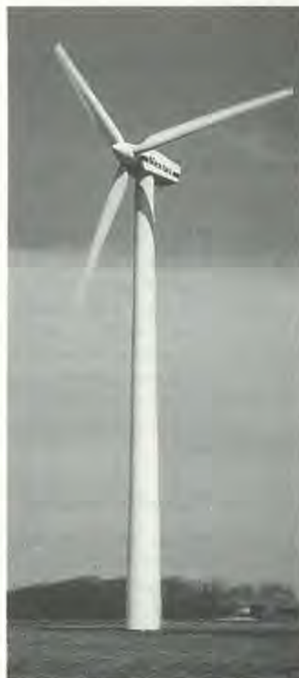
The GEF has 3 projects to develop wind energy. They are in Mauritania, Eritrea, and Kazakhstan. They amount to $2.9 million of the GEF climate portfolio of $177 million.

See article on page no. 4, and the information box about the GEF structure and operations on page no. 5.