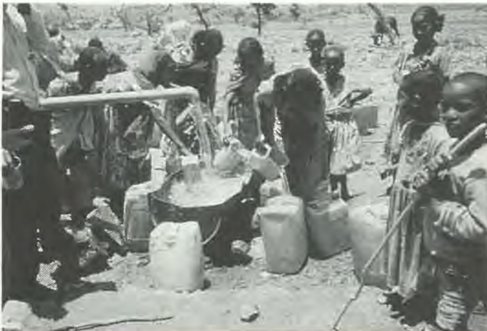
PV used for water pumping in Eritrea (above) and in Mali (below)

The UNDP/GEF climate change portfolio for the period 1991-1997 amounts to $177.4 million. For Africa, 36 projects are included in the portfolio. Almost 60% of these projects are classified as "enabling" (see box) activities, 17% are within the purview of the Project Development Facility (PDF), and 22% are full-fledged projects. A selection of these activities is briefly described below.