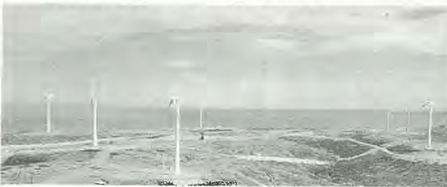
The biggest windmill park in Argentina at Comodoro Rivadavia, 1997.

400 participants including NGOs were invited to the World Bank Workshop of "Renewable Energy in Rural Markets," March 25-26, 1998 in Buenos Aires, Argentina.