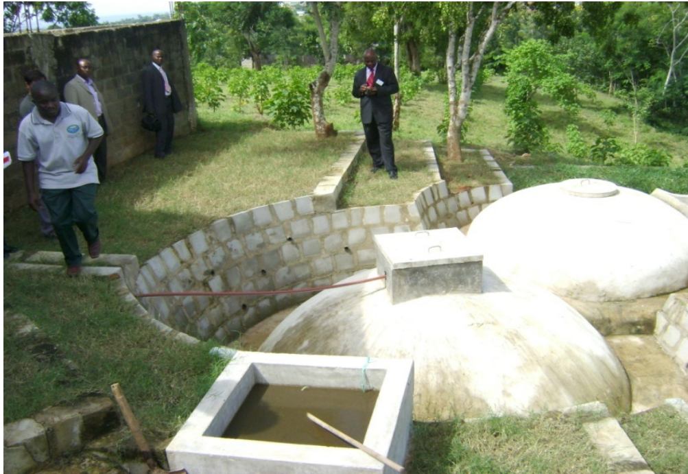
Photo of a Bio-digester

“PROMOTE LOCAL CLIMATE SOLUTIONS TO END POVERTY”