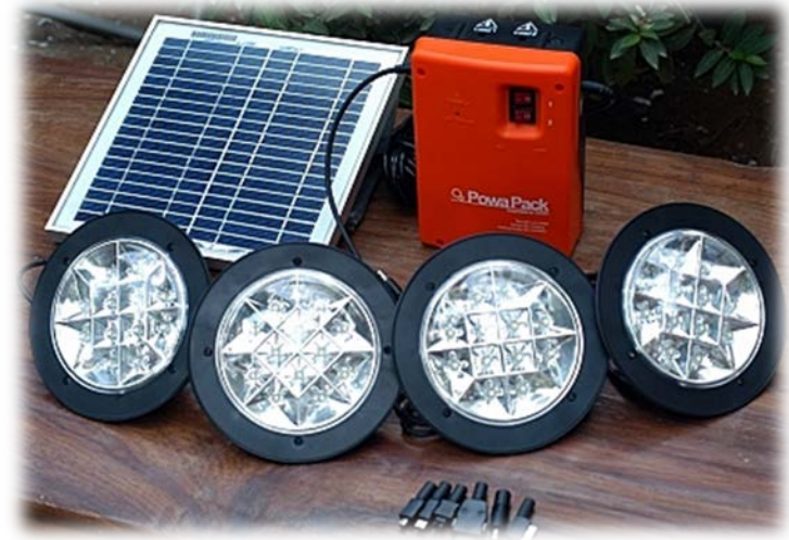
Household solar system

“PROMOTE LOCAL CLIMATE SOLUTIONS TO END POVERTY”