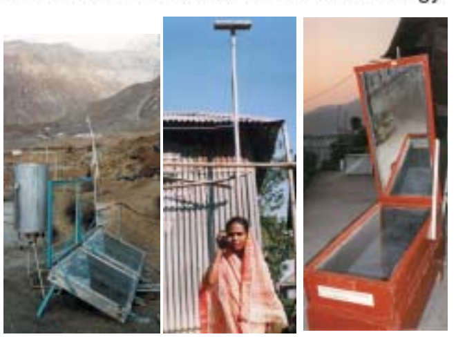
INFORSE South Asia is a regional network of independent non-governmental organisations that encourage the growth of sustainable energy solutions in order to reduce poverty and protect the environment.