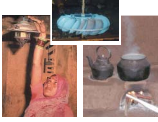
Since its founding at the Global Forum in Rio de Janeiro, Brazil, in 1992, INFORSE has grown to more than 140 members, of which 21 are in South Asia