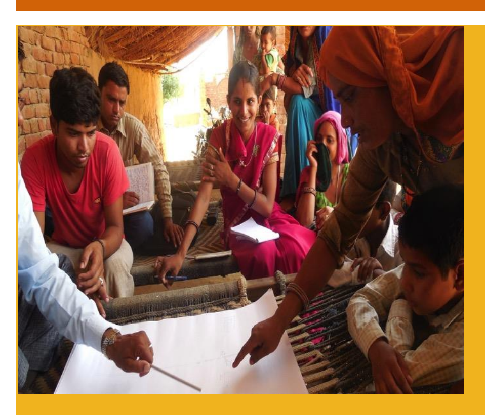
Community involvement for design and needs assessment