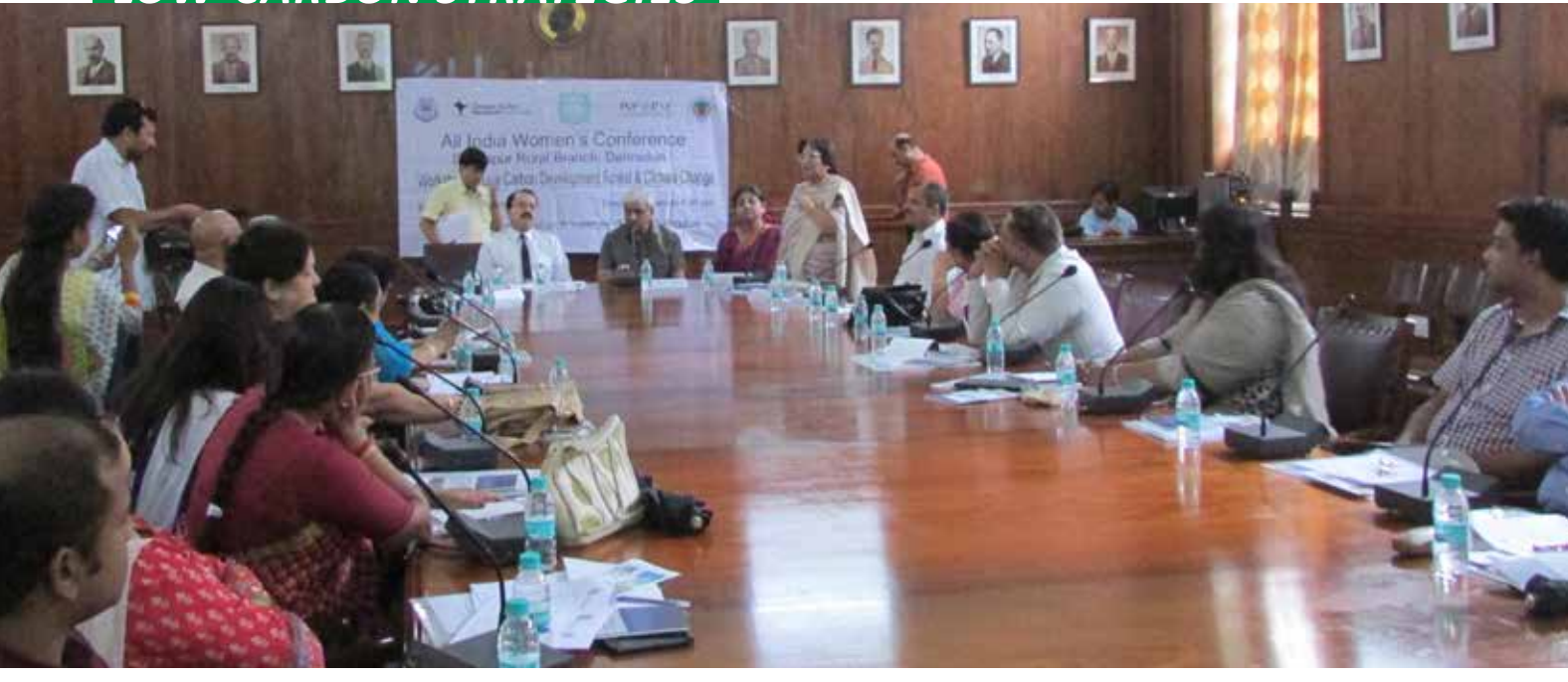
► Article continued from the previous page