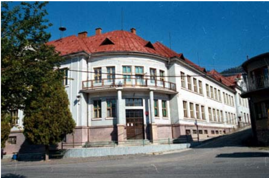
Lubietova: Primary school. Installed output of biomass boiler: 200 kW