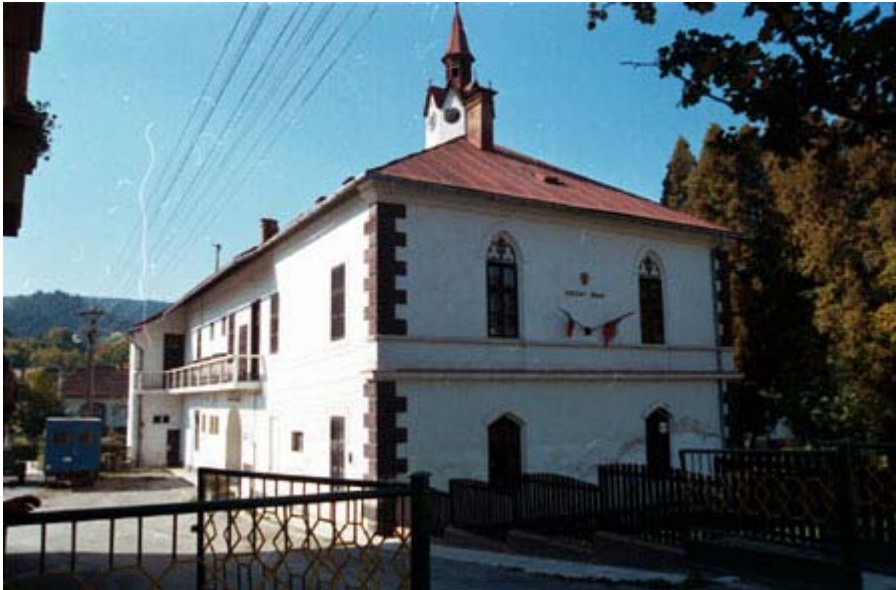
Lubietova : Municipal office + Post office. Installed output of biomass boiler : 200 kW

Annual total emission reduction of gaseous effluents will be 51,9 tons of contaminants and 2643,4 tons of greenhouse gases per year for all facilities.